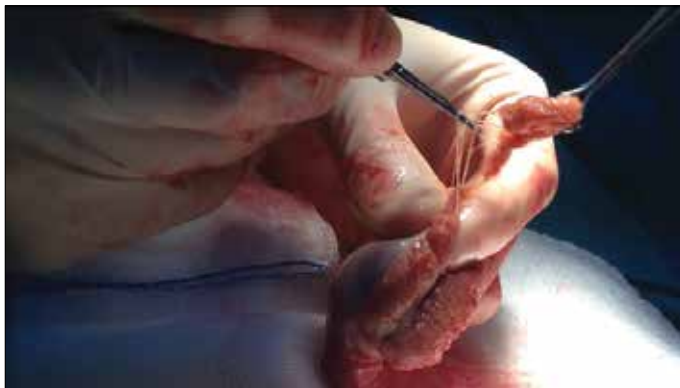
Figure 1. Intraoperative image of partial orchiectomy

Large-cell calcifying Sertoli cell tumor should be evaluated for the genetic dysplastic syndromes. Due to benign behavior of this tumor, partial orchiectomy should be the treatment of choice if the tumor is eligible for the organ-sparing surgery.