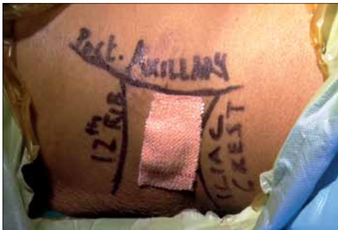
Figure 3. Post operative photo with the minimal compressive dressing over the puncture site.

After complete clearance of the stones, assessed by fluoroscopy, the nephroscope along with the outer sheath was removed and compressive dressing was applied. Neither nephrostomy tube nor any skin suture was required in any of the cases. Only compressive dressing was applied at the surgical site (Figure 3).