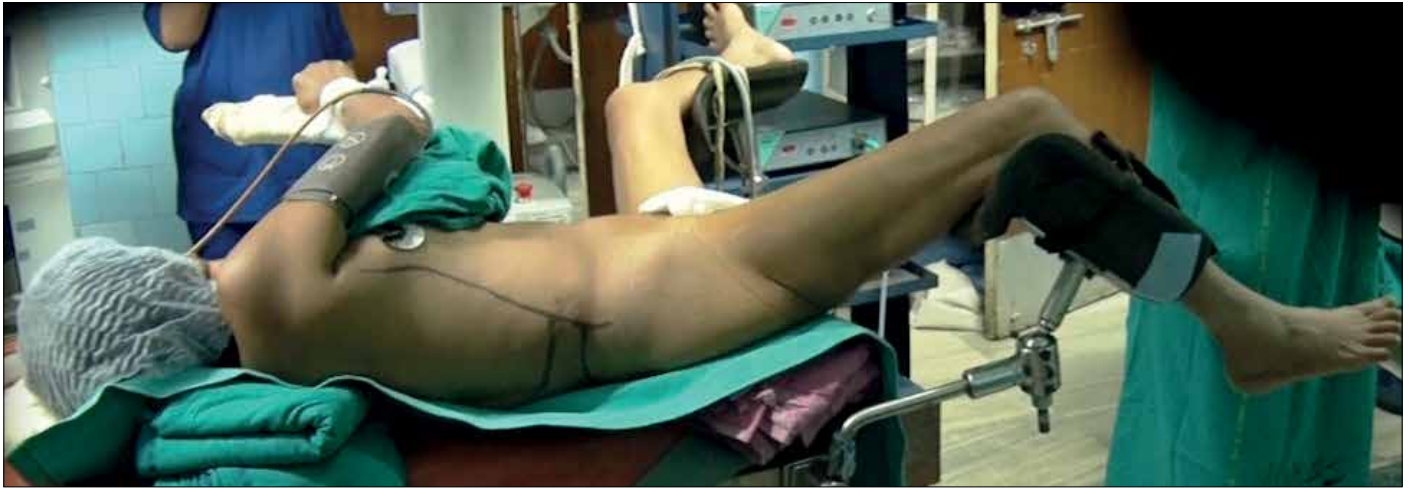
Figure 1. Galdakao modified Valdivia position