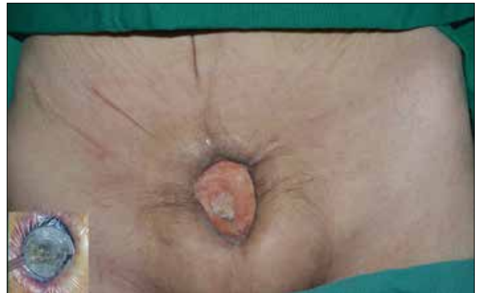
Figure 2. VAC applied to open wound after surgical debridement. Gross appearance of the wound, which was healed and filled in with granulation VAC: vacuum-assisted closure therapy