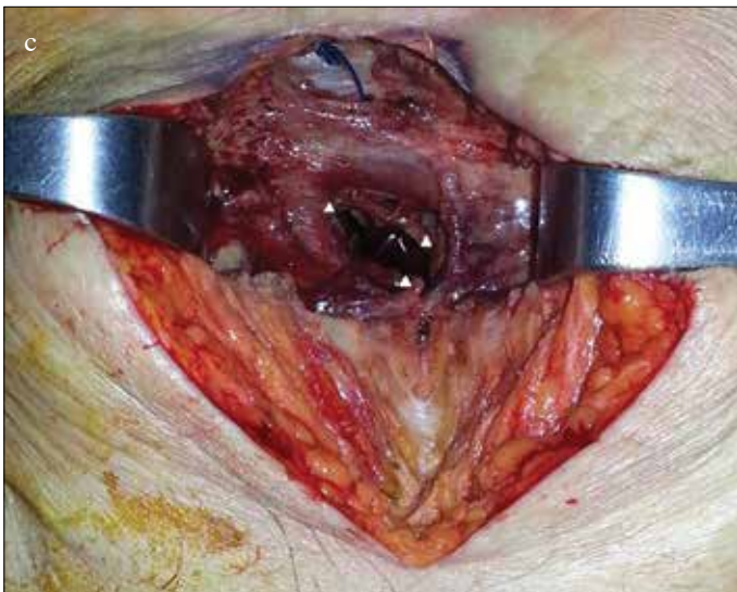
Figure 1. a-c. (a) Computed axial tomography of the abdomen showing the tract between the anterior wall of the bladder and suprapubic area. (b) Cystogram showing leakage at the anterior bladder wall. (c) Gross appearance of suprapubic area at surgery. An opening of suprapubic skin connected to the anterior wall of the bladder