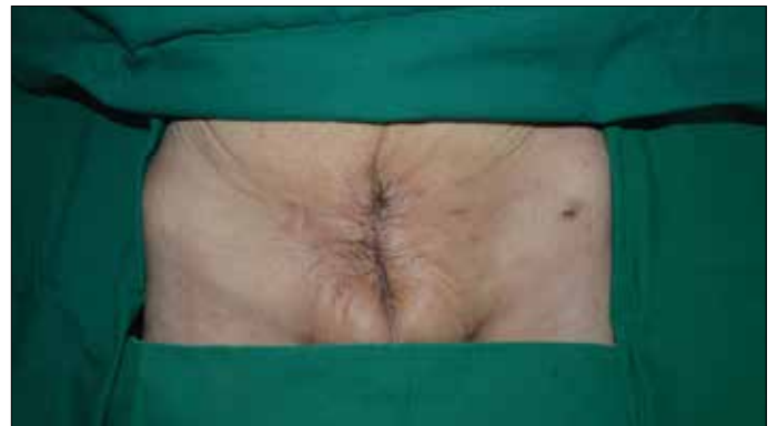
Figure 3. Gross appearance of the wound before discharge