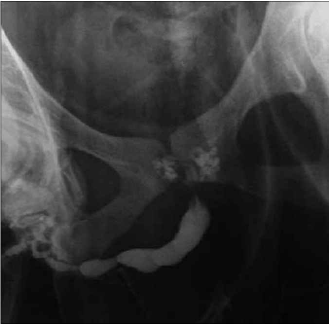
Figure 1. Retrograde urethrogram in patient number one and three showed the urethral stricture at the junction of native and neourethra with dilatation of the native urethra and reflux of contrast into the seminal vesicles