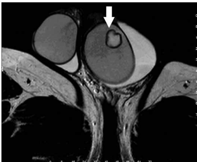
Figure 1. Intratesticular mass seen in the MRI (arrow)

Testicular cancer is a rare disease accounting for 1-2% of male neoplasms and the most commonly malignancies were found in 20 to 34-year-old man. Usually they begin as a palpable, solid