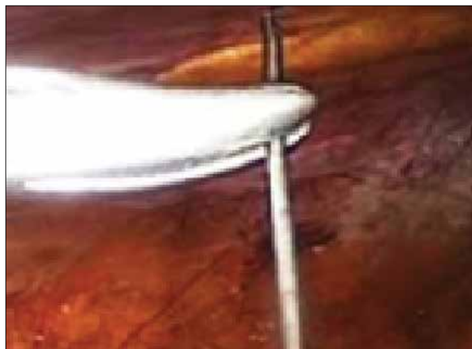
Figure 1. A flattened suture needle application for stabilization of the anastomotic site through the abdominal wall