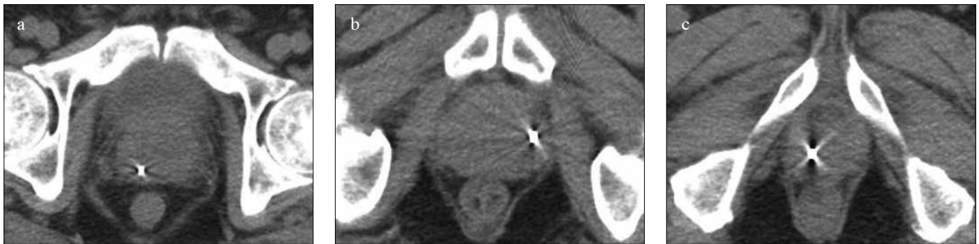
Figure 2. a-c. Axial CT images demonstrating inserted gold markers in the right base (a), left deep mid-gland (b) and right apex (c) of the prostate

500 mL of water before the planning CT. The slice thickness of the CT was 2 mm. CT images obtained from the days of insertion up to radiotherapy planning were imported to the Eclipse treatment planning system (TPS, Varian Medical Systems, Palo Alto, CA, USA) to analyze the position of fiducial markers. Point- based marker match algorithm through rigid translations and rotations was used to find the distance of migration. After registration, the mean and maximum distances between each fiducial markers were recorded. Patients were divided into two groups: those who had CT simulation 11 days before (the median time from fiducial marker insertion to treatment planning CT) or after radiotherapy planning.