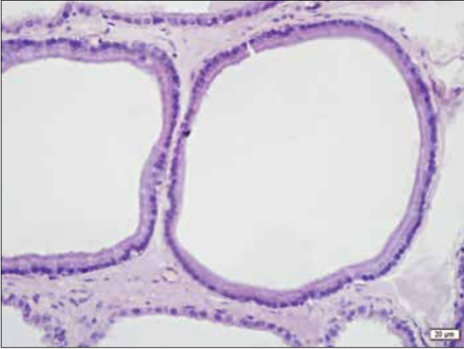
Figure 1. Normal acini was seen in Group 1, x40 magnification with H&amp;E