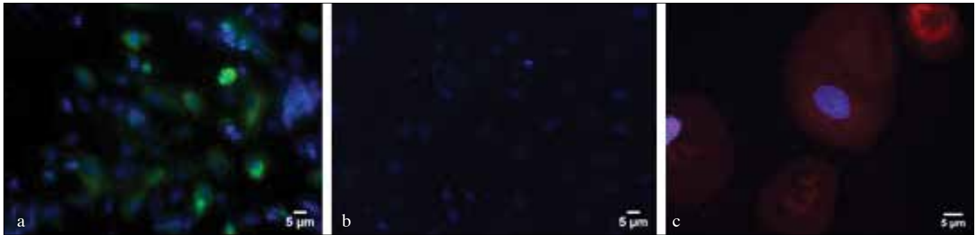
Figure 2. a-c. Urine- derived cells were immunostained with specific monoclonal antibodies. (a) Some of the cells were positive for urothelial cell marker cytokeratin 7 (green fluorescence) while the others were negative for the same antibody. (b) hUDCs were not labelled with haematopoietic marker CD 45. (c) Some hUDCs in culture were stained with mesenchymal stem cell marker CD90 and emitted red fluorescence. All of the cells were counterstained with nuclear stain DAPI (blue fluorescence). Each scale bar indicated 5 \mu\text{m}

One of the most important results of the present study is that that human urine contains mesenchymal stem cells together with urothelial cells. This result is in compliance with the results other studies published in recent years. [4,6,8,9]