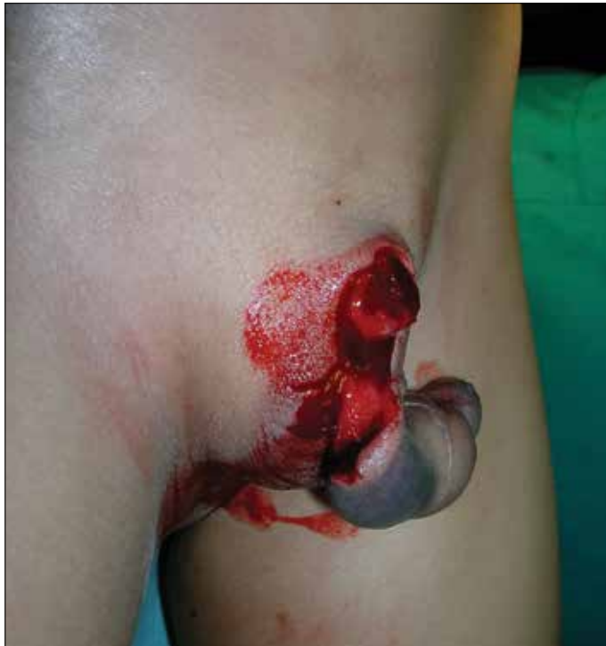
Figure 1. Lateral view of the amputated penis involving the complete transection of the penis

examination revealed that the amputation was in the base of the penis and involved the complete transection of the penis (corpus cavernosum, spongiosum and urethra) with only 1 cm wide skin tissue left. There were edema and signs of ischemia on the penis (Figure 1, 2). After passing a Foley catheter, a macroscopic re-implantation was performed with suturing urethra and tunica albuginea. The postoperative course under intravenous antibiotics and heparin was uneventful after the regeneration of a small necrotic area of the glans (Figure 3). The catheter was removed 2 weeks later. After 3 months of