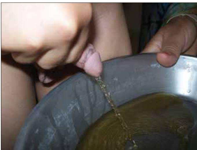
Figure 7. Good urine stream at 6 months of follow up after anastomosis

9) and five days later the edema resolved and the patient discharged. In the circumcision accident group, the patient with penile amputation presented 6 hours after the accident without the amputated penis in a tertiary center. Hemostasis was achieved and stitches between urethral mucosa and skin of the penile stump were made to prevent stenosis. The patient was referred to our center 4 months later (Figure 10). A phalloplasty was performed, the penile stump was dissected, the suspensory ligament was divided and scrotal flaps were used to cover the penis (Figure 11). The postoperative course was uneventful