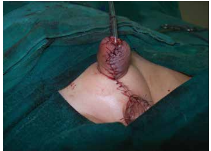
Figure 11. Phalloplasty by the dissection of the remaining corpus cavernosum and closure of the defect with scrotal flaps

defect was closed with scrotal flaps (Figure 15). The postoperative course was uneventful and the patient was satisfied. After one year follow-up the urine stream was good without meatal stenosis.