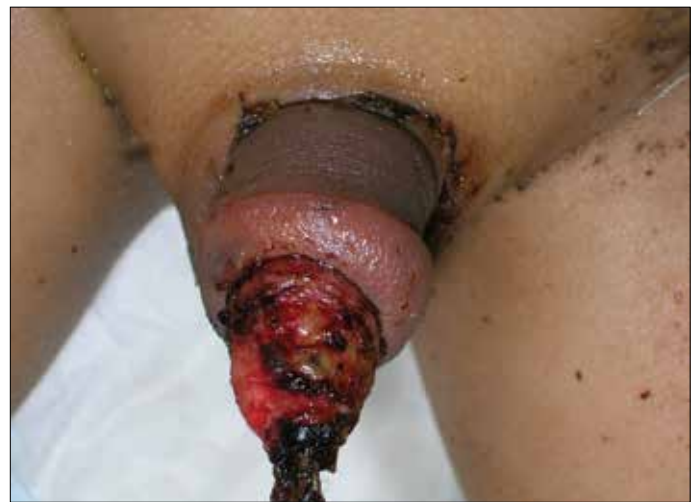
Figure 3. During the healing

follow up the patient was doing well with a good urine stream at the examination (Figure 4). Because of familial problems the patient and his mother moved to another city and he was lost to further follow up. In the strangulation group, the first patient was a 6 year-old boy presented with a hair tie splitting the urethra, the patient and his mother denied the circumstances and the date of the accident. The urethra and the corpus spongiosum were completely split at the coronal area (Figure 5). The hair tie was removed under general anesthesia (Figure 6) and 6 months later a dissection of both ends of the urethra with anastomosis was performed. The postoperative course was uneventful; the transurethral catheter was removed on the 15 th postoperative day. After 3 years of follow-up the patient had a good urine stream (Figure 7), the glans was sensible, and morning erections were present. The second patient of this group presented with a swollen penis in a constricting nut (Figure 8). Under general anesthesia the nut was cut (Figure