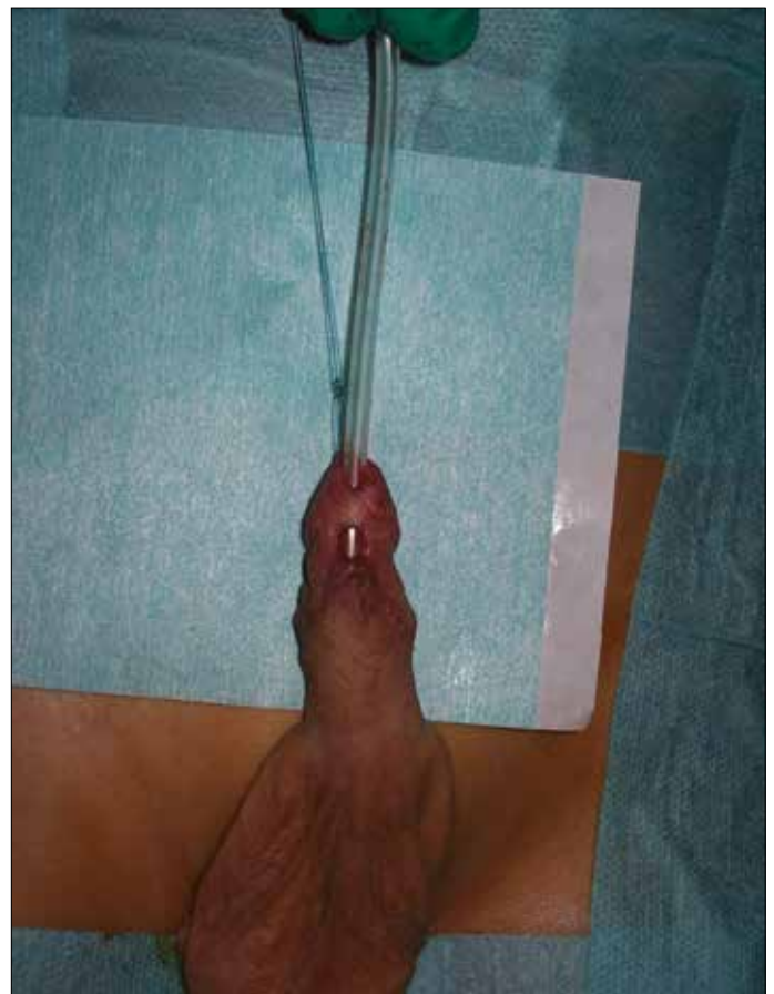
Figure 12. Glanular urethrocutaneous fistula