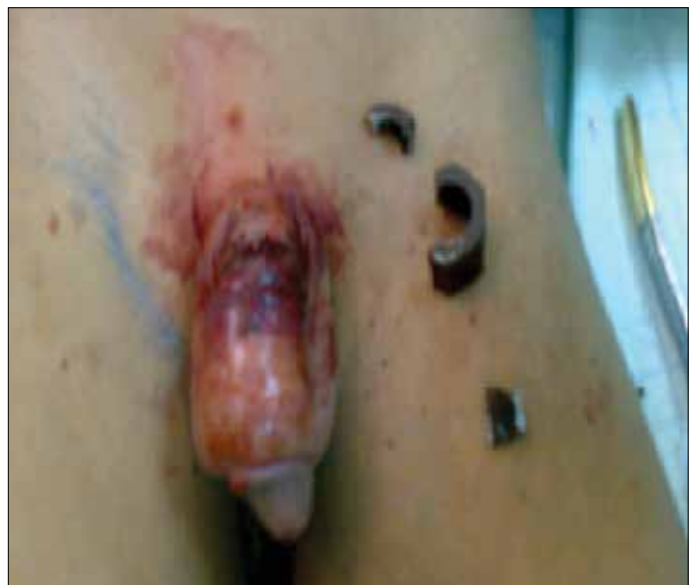
Figure 9. After cutting the nut